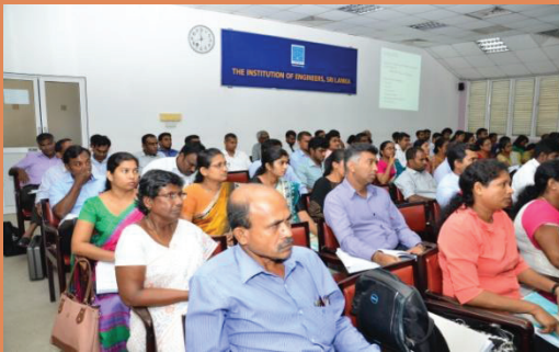
A Section of the audience that attended the Presentations

The Presentation of Technical Papers for the 110 th Annual Sessions of the IESL was conducted on 17 th and 18 th October 2016 at the Wimalasurendra Auditorium and the conference room of the institution in parallel sessions. As with the previous years, the Call for Papers attracted a large number of papers, under the various disciplines. Papers underwent a double blind refereeing process, and all papers presented were of very high quality. Moreover, marked improvements were observed in the number of authors and attendees from the industry at the presentations, possibly due to the wider and more focused publicity given, and relevance of the papers to the industry. The Proceedings of the sessions are published in the Annual Transactions- Part B of the IESL.